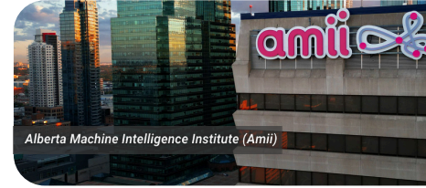
Alberta Machine Intelligence Institute (Amii)

Canada's largest apprenticeship trainer works directly with companies to commercialize products. NAIT ranks third among the top 50 Canadian research colleges and polytechnics.