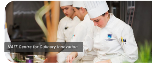
NAIT Centre for Culinary Innovation

Provides technical and industry development support for the development, scale-up and commercialization of non-food value-added products and applications.