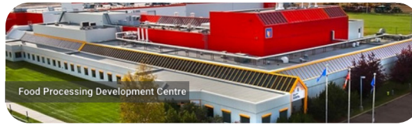
Food Processing Development Centre

A 65,000 sq-ft pilot plant and product development lab, featuring over $20 million in equipment, supports food innovation from development to commercialization.